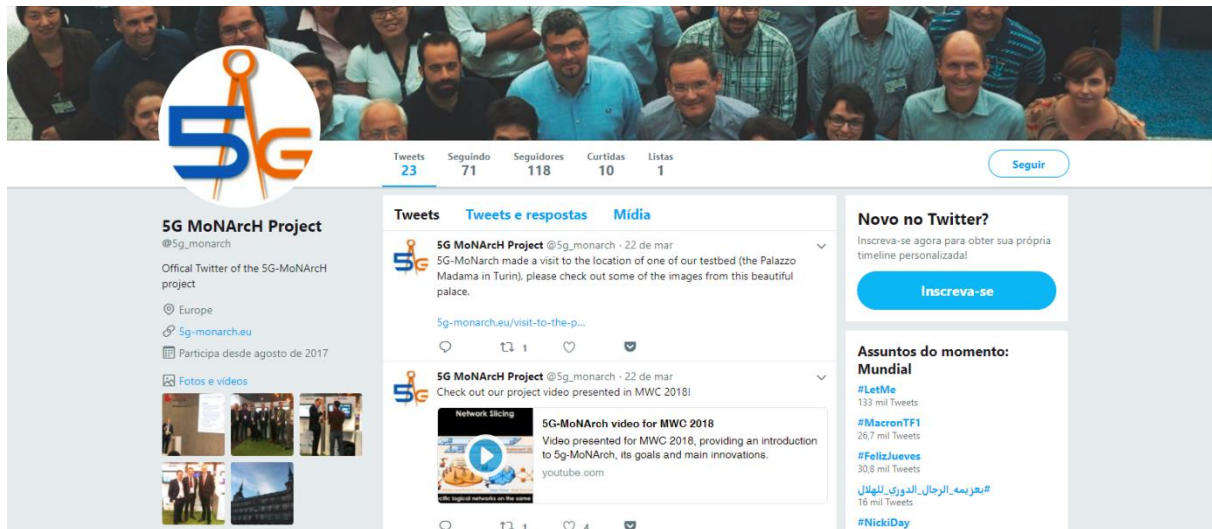
Figure 2-3: 5G-MoNArch Twitter account