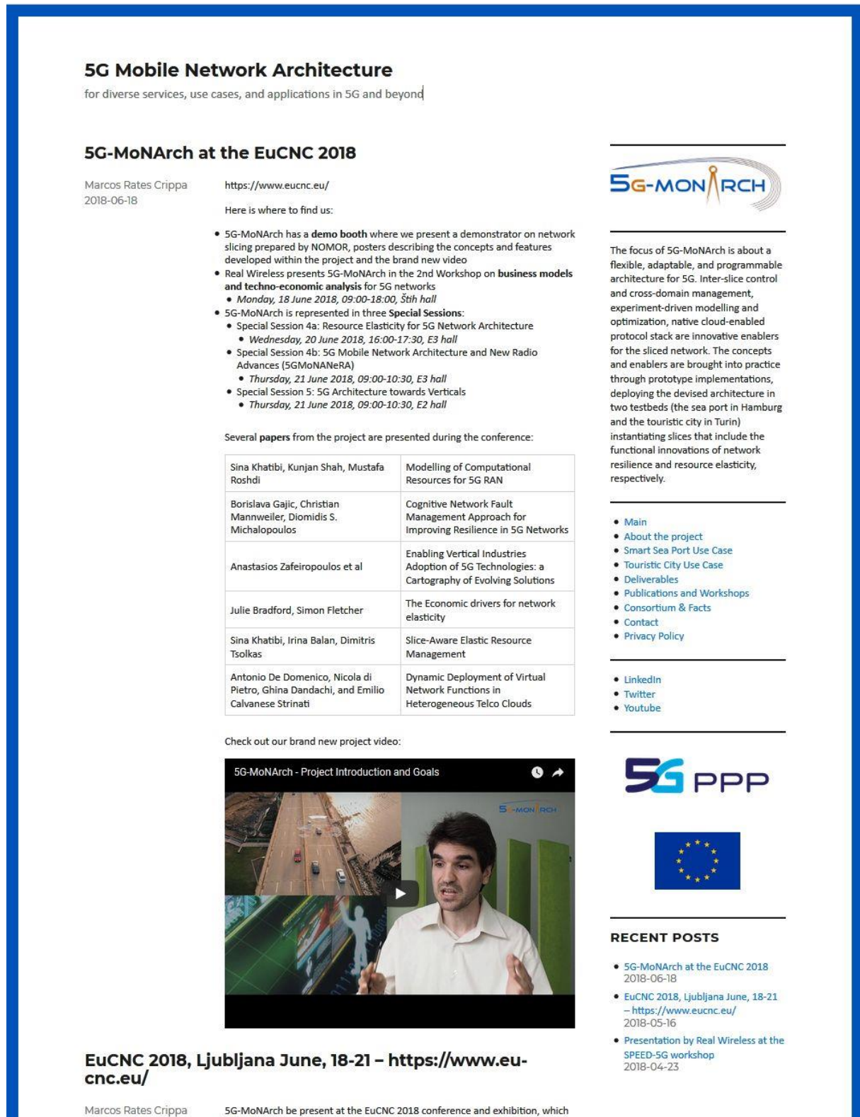
Figure 2-1: 5G-MoNArch website home page