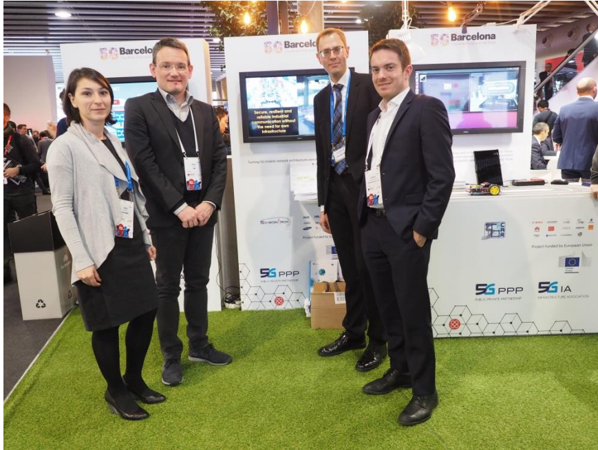
Figure 2-4: 5G-MoNArch delegates at the 5G Barcelona pavilion in MWC 2018

The participation to the MWC 2018 is a big achievement for the project in terms of getting a dissemination opportunity within the world's largest presence of the 5G community. During the four days event at the pavilion the Project Coordinator gave an overview presentation about the project, and the news was also reported to the 5GIA (see https://5g-ppp.eu/5g-ia-and-5g-ppp-at-the-mobile-world-congress-2018/ ).